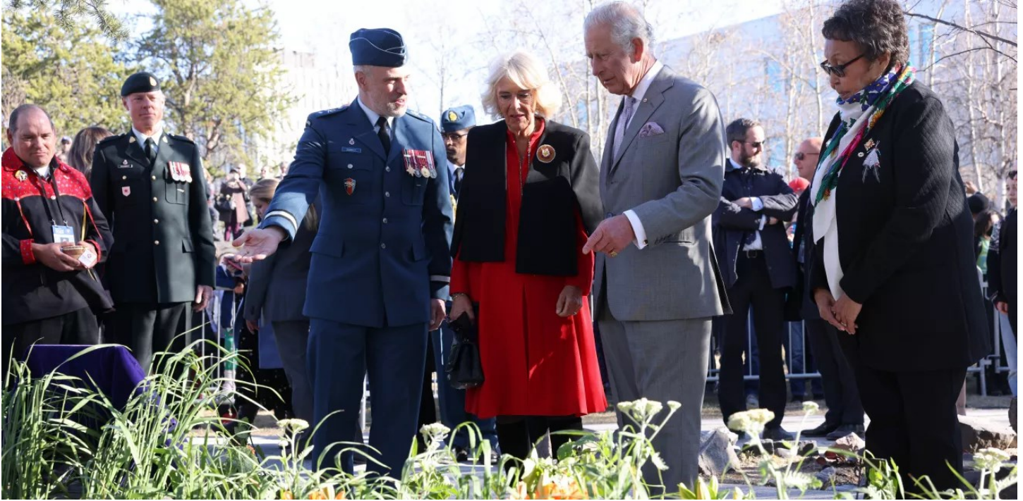
The King and Queen (then Prince of Wales and Duchess of Cornwall) are shown the Yellowknife Platinum Jubilee Treaty Garden. Commissioner Margaret Thom stands on the far-right.

Task: Contestants must locate the three medicines (sage, cedar & tobacco) in the Platinum Jubilee Treaty Garden , take pictures of their leaves and make their way to the Ceremonial Circle nearby. There they will find an elder who will look at the pictures to see if the contestants have successfully identified the right medicines.