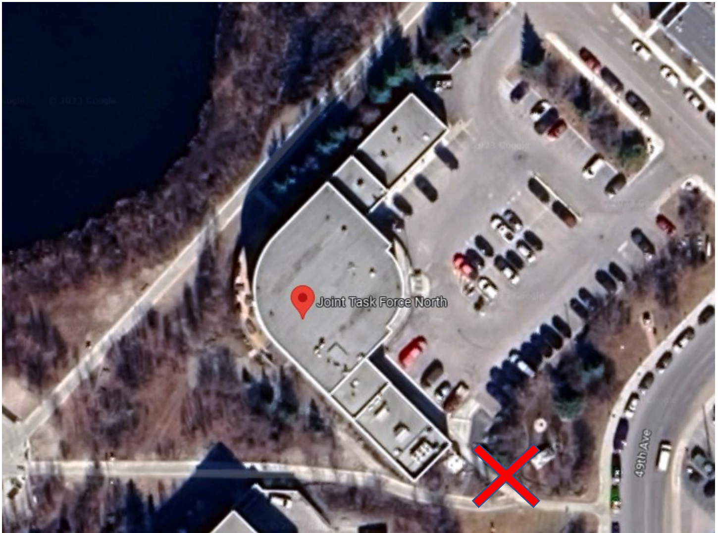
Map of Joint Task Force North showing the location of the Platinum Jubilee Treaty Garden.

Contestants will drive their Tesla Model Y into the City of Yellowknife and locate the headquarters of Joint Task Force North at 4816 49 St, Yellowknife, NT X1A 2R3. Once there, contests need to locate the Platinum Jubilee Treaty Garden that was planted on the grounds of Joint Task Force North in May of 2022.